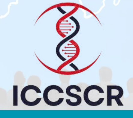
EXHIBIT @ ICCSCR 2024

+44-7418342651 info@cienciemeetings.com https://cienciemeetings.com/iccscr/